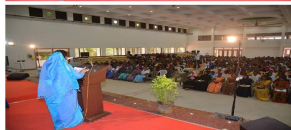
DBT Star College Scheme Implementation & MoU Signing with RVS College,Coimbatore on 28.07.2023