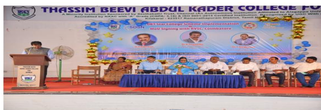
Photo gallery of the activities in entrepreneurship development cell from 2023-2024: