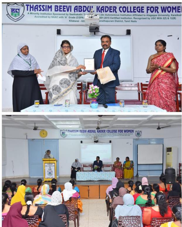
Central Library, IQAC and Research Development Cell of our college conducted an Workshop for Faculty members on Developing a Knowledge Framework for Effective Research, Teaching, Learning, Funding, Patents, Admission and Branding of Institution" on 04.11.2023