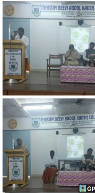
Department of Microbiology and Research and Development cell conducted one day Seminar on Microalgae- A Potential Bio-resource for present and Future on 27.07.2023